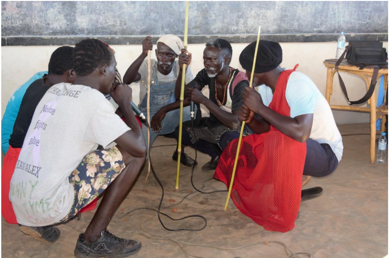
Figure 3 Fun time comedy performing their comedy at the semi-finals