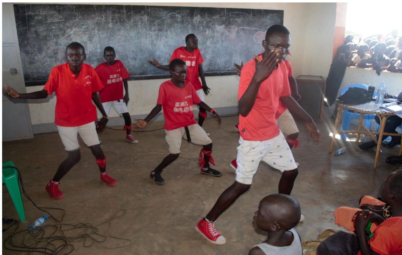
Figure 1 Swagga Boyz from Basecamp Zone showcasing their talent at the semi –finals in Zone II