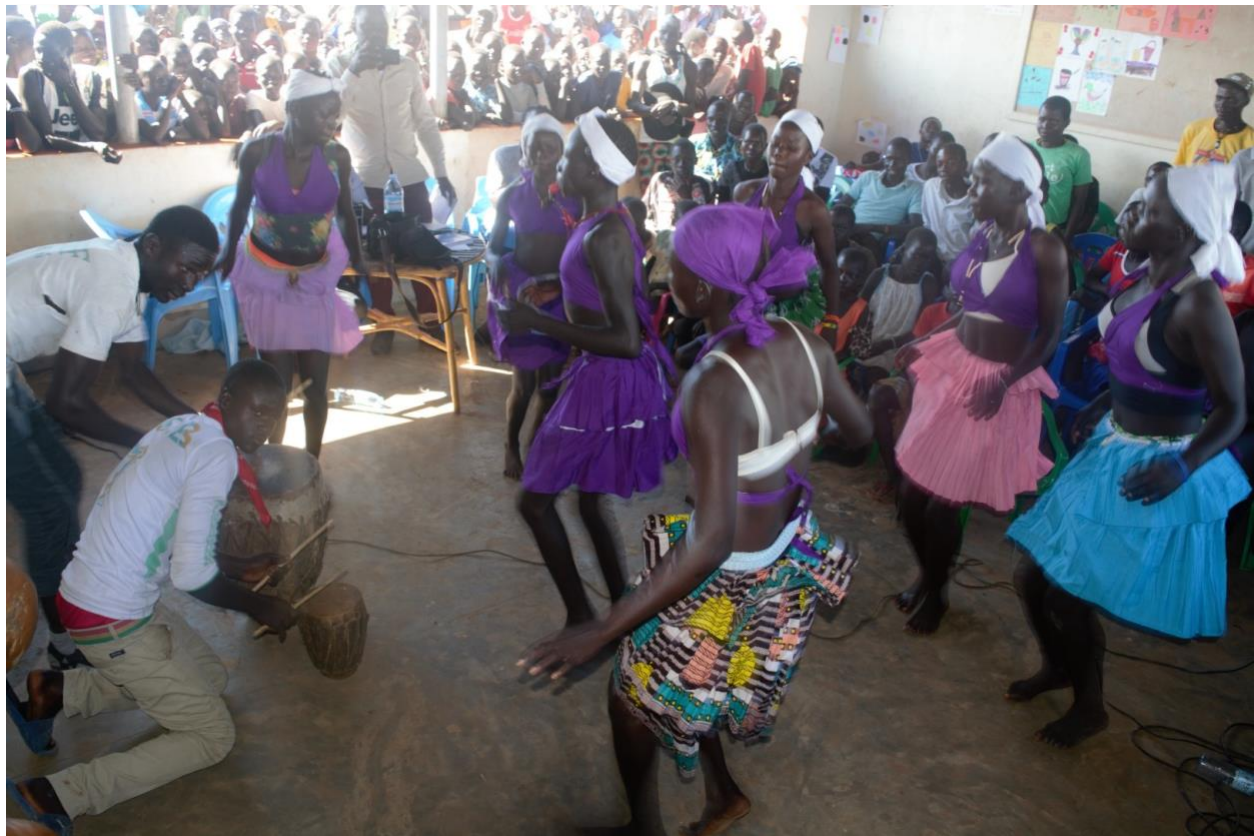
Figure 6 Acholi traditional dance group performing their cultural dance at the semi-finals.